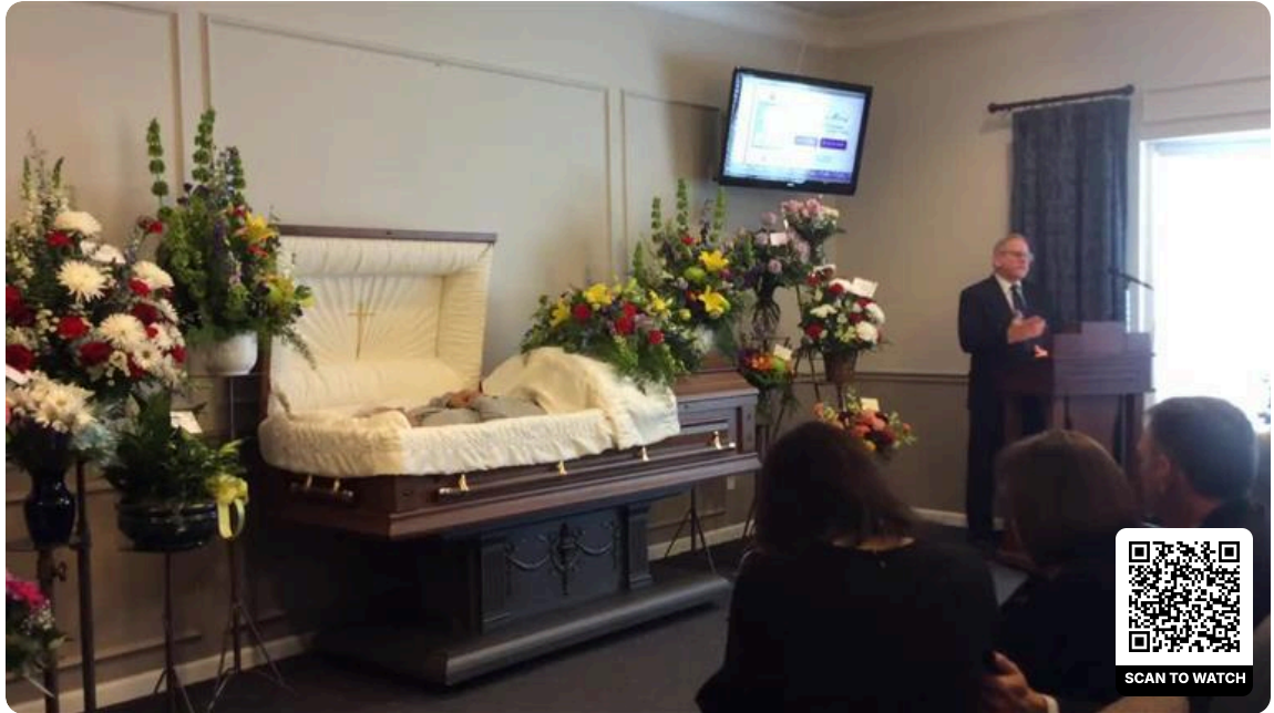
Funeral Service Recording

Eineder Funeral Homes shared a video to the Funeral Service Recording November 26 at 5:30 AM album.